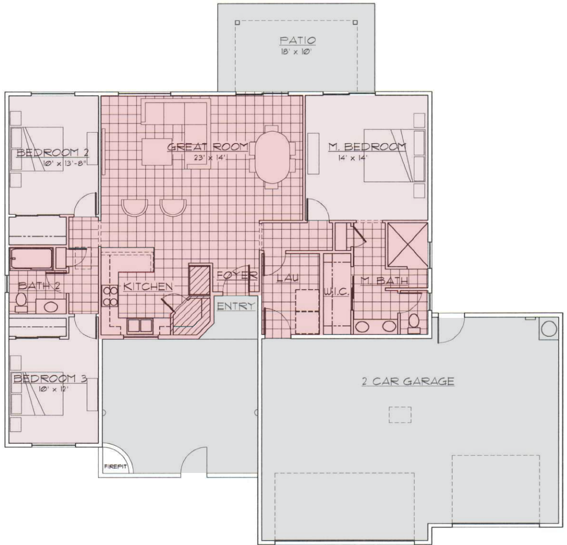
FLOOR PLAN 1509 SQ. FT. LIVING SPACE